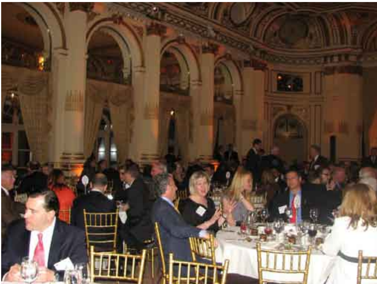
Guests at the PA GOP Commonwealth Club Luncheon