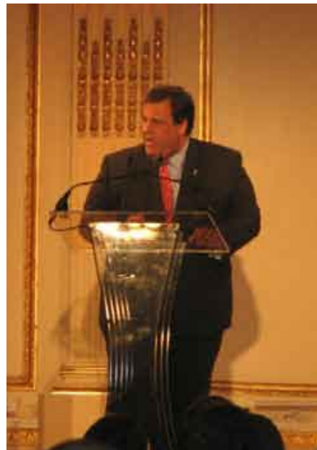
New Jersey Governor Chris Christie